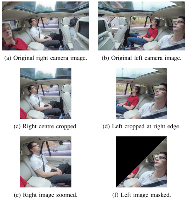
Fig. 3. To get an input from the right camera, the original right image (a) is centre cropped, result shown in (c), and then zoomed in to get (e). To get an input from the left camera, the original left image (b) is square cropped from the rightmost edge, result shown in (d), and afterwards a triangular mask is applied on the top left of the image to get (f).

We take advantage of the fact that the camera positions are fixed and so the video can be pre-processed to make it easier to classify. The right viewpoint video data is cropped and zoomed in a way to focus only on the subject, leaving out background information so that the model can focus mainly on the subjects' movements and not on the surroundings. Figure 3e shows an example of the final input from the right viewpoint. Moreover, for the left viewpoint video data, the