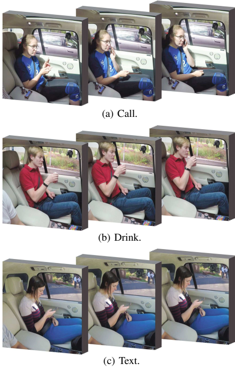
Fig. 4. Correctly classified input images.