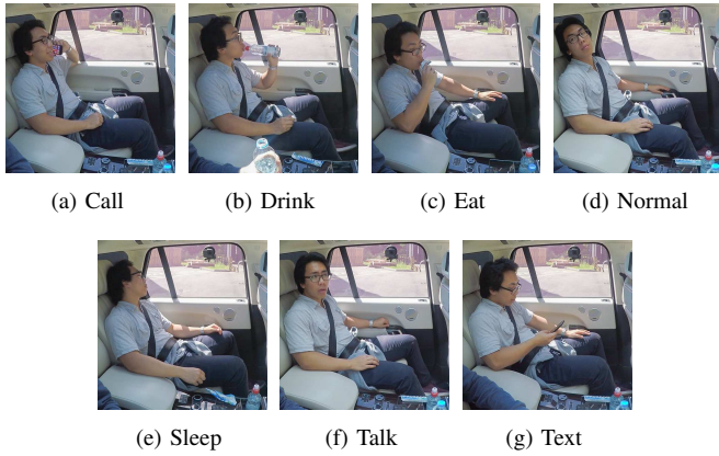
Fig. 1. Passenger state image examples.